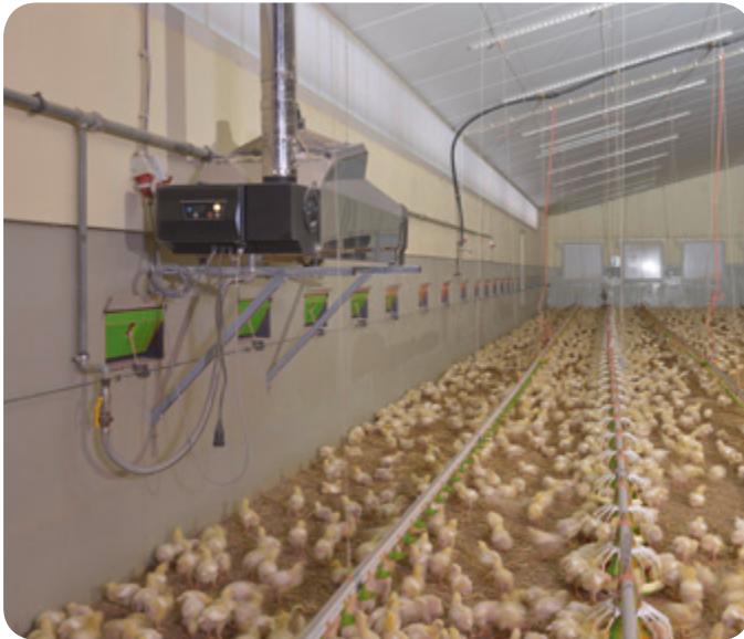
Thermorizer TR 75 in a chicken shed

The direct spark ignition and burner operation are monitored using ionization control. If the flame goes out or the device does not ignite, the gas supply is stopped immediately by the control unit.